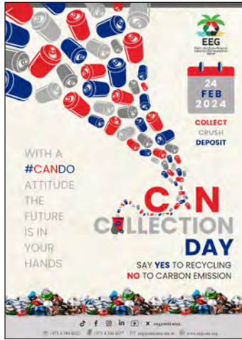
Can Collection Day 2024