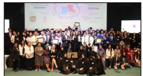
The coveted rolling trophy went to The Philippine School, Dubai (Senior Team) who managed to score the highest points in this year’s competition.